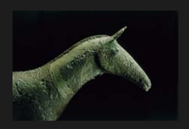
Horse from Trundholm chariot.

The rise of Bronze Age society: new results from science and archaeology